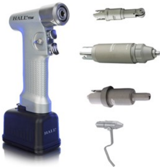
Figure 2. Example of a single handpiece with various attachments.

Notably, some OPIs have modular handpieces that can be converted between handpiece types instead of separate dedicated handpieces. For example, Figure 2 depicts a handpiece that can be converted to a different functionality using adaptor attachments.